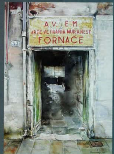
Into Murano 14" x 10" watercolor on paper

Reception: Thursday, February 10 Artist will be present.