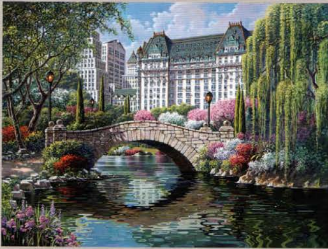
"Springtime in New York"