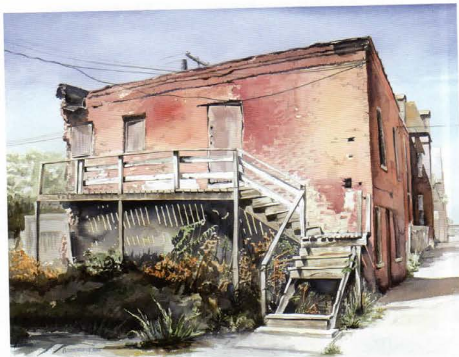
Tony Armendariz , Red Brick Series: 2, watercolor, 20 x 26"

"I try not to limit myself to one subject in case I see something different I think would be a strong painting."