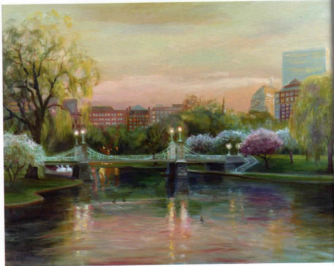
A Z Fine Arts , Golden Glow of Boston , oil on canvas, 30 x 40", by Celia Judge.